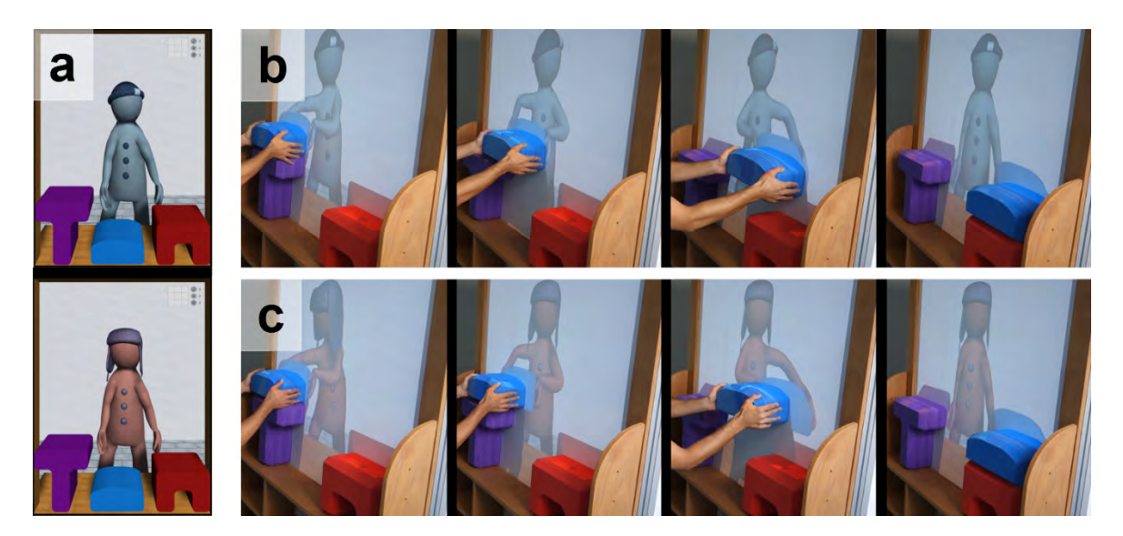
Figure 3: a. The two virtual agents. b. Movement sequence in following mode. c. Movement sequence in leading mode.